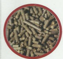
1kg Wood Pellets

# 1-11-304, Opp. Electrical Sub Station, ICICI Bank Lane, Bagwantpur, Near Old Airport, Begumpet, Hyderabad - 500 016. T.S. Email : ambbiomass@gmail.com, www.ambbiomass.com Ph : 040-65558199, 9030008199.